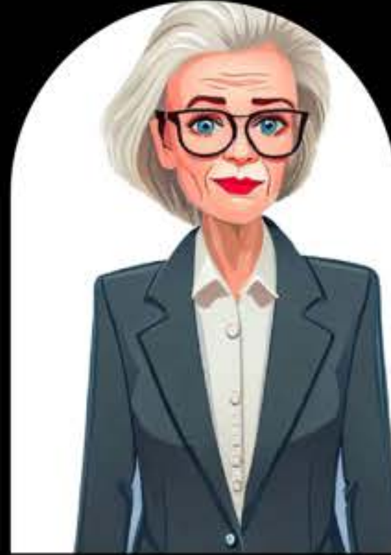
MACY - 60

OLDER (MID 60'S) HEAD OF THE 'LUCID DREAMING MOVEMENT'